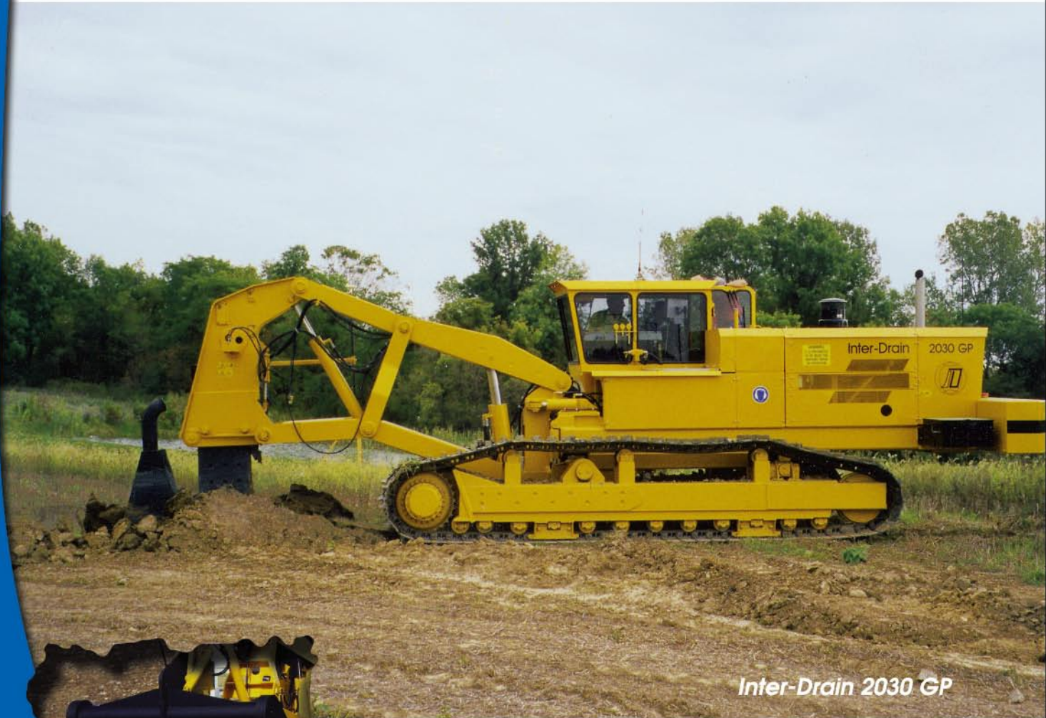
Inter-Drain 2030 GP